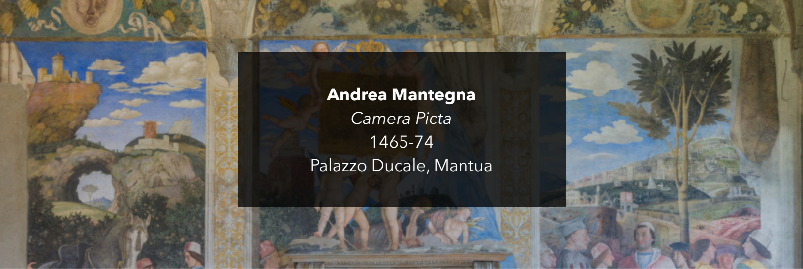
Andrea Mantegna Camera Picta 1465-74 Palazzo Ducale, Mantua